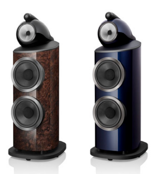
801 D4 Signature*